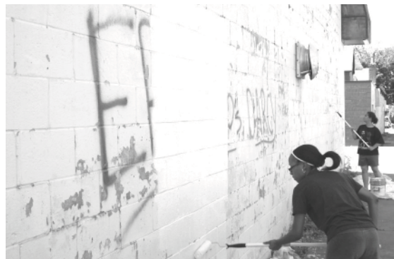
Volunteers paint over graffiti.

This past October a group of community volunteers partnered with The HomeOwnership Center, teenagers from the Youth Construction Initiative Program at Proctor High